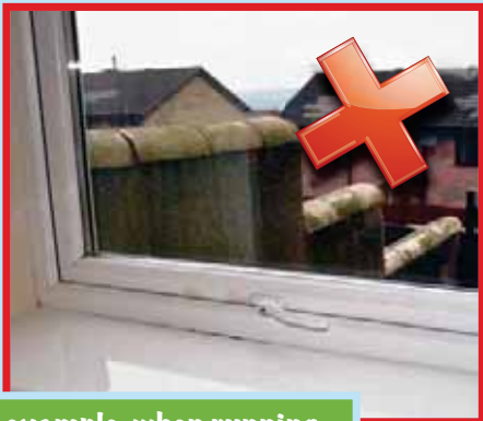
for example, when running to let the steam escape.