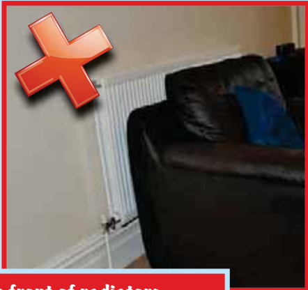
in front of radiators